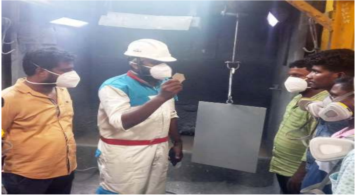
❖ Welder safety being patrolled Third Party Inspectors.